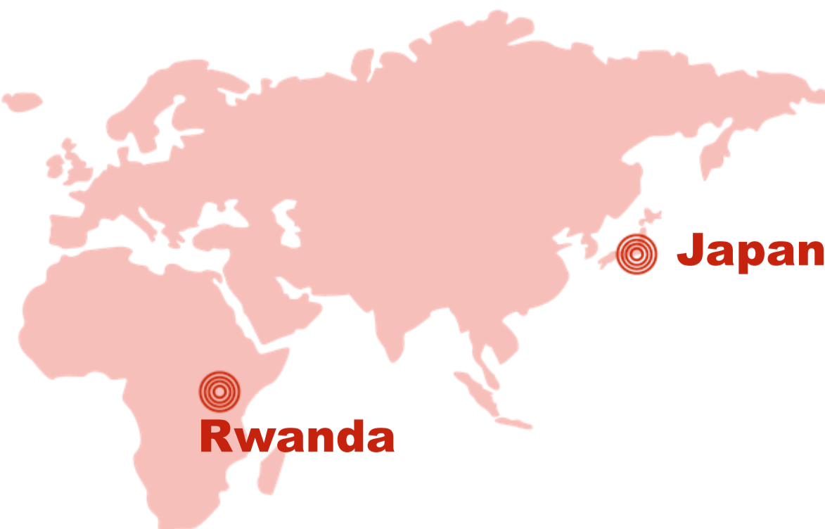
TABLE FOR TWO is a social initiative that addresses the conflicting issues of hunger and obesity through a unique "meal-sharing" program.

When you dine at TABLE FOR TWO, you never dine alone.